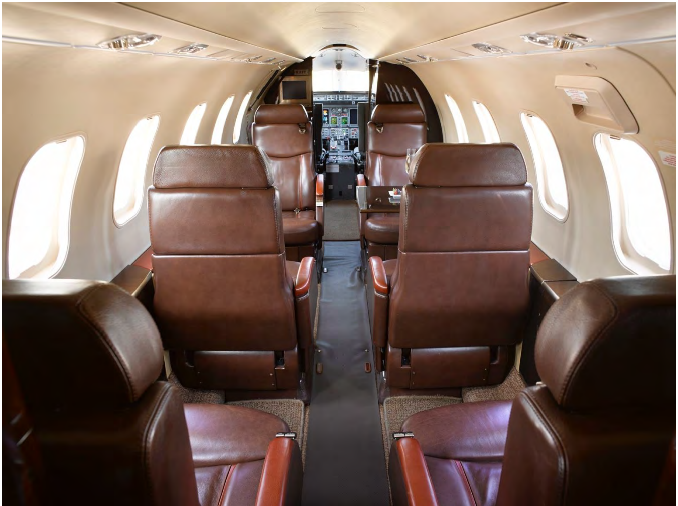
MAIN CABIN FORWARD FACING

GLOBAL HEADQUARTERS 757 S.E. 17th Street #120 · Fort Lauderdale, Florida 33316 +1 (954) 703-1600 · www.eastcoastjetcenter.com