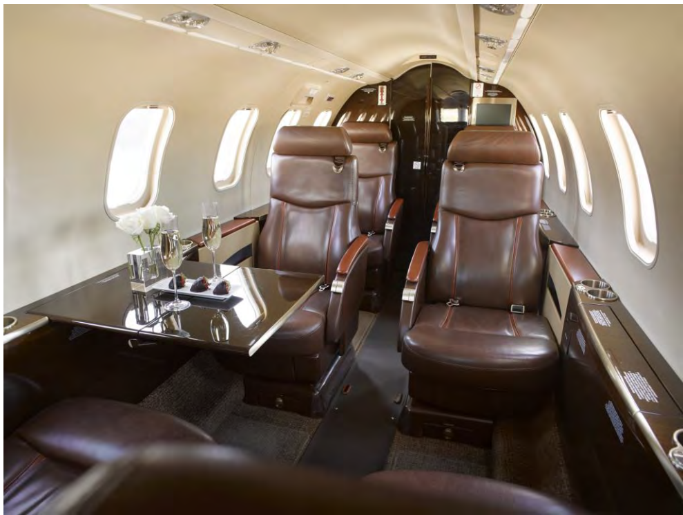
MAIN CABIN AFT FACING

GLOBAL HEADQUARTERS 757 S.E. 17th Street #120 · Fort Lauderdale, Florida 33316 +1 (954) 703-1600 · www.eastcoastjetcenter.com