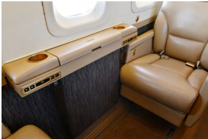
CABIN & SIDEWALL