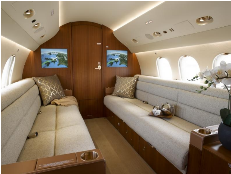
Two (2) 80" 16G Electric Berthing Aft Three-Place Divans (AFT Facing) (NEW in process)