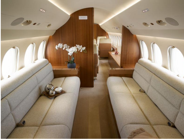
Two (2) 80" 16G Electric Berthing Aft Three-Place Divans (Forward Facing) (NEW in process)