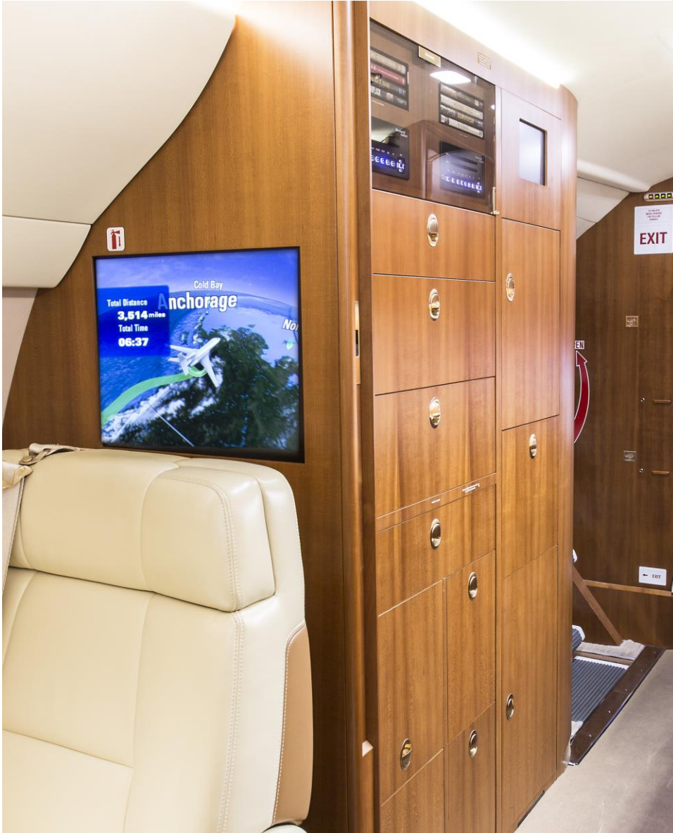
Forward Left-Hand 38 Inch Entertainment Cabinet/Closet