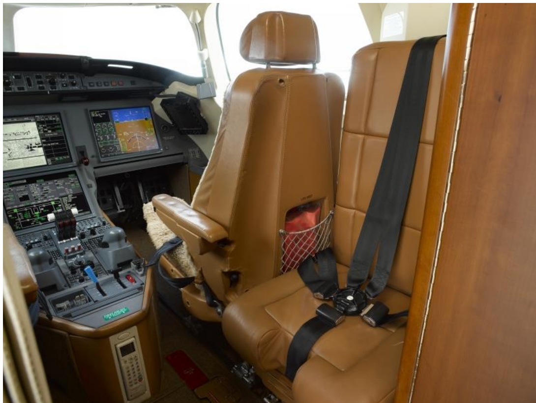
Side Facing 16G Third Crew Seat (Jumpseat), (NEW in process)