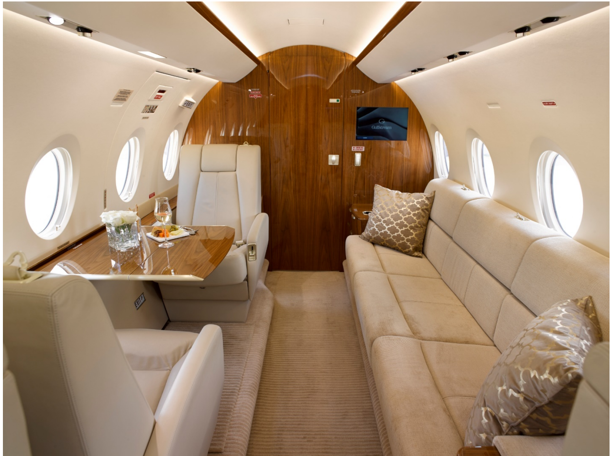
CABIN AFT DIVAN & HALF CLUB SEATING

2016 Gulfstream G280 Serial G280-2101 VP-BRJ