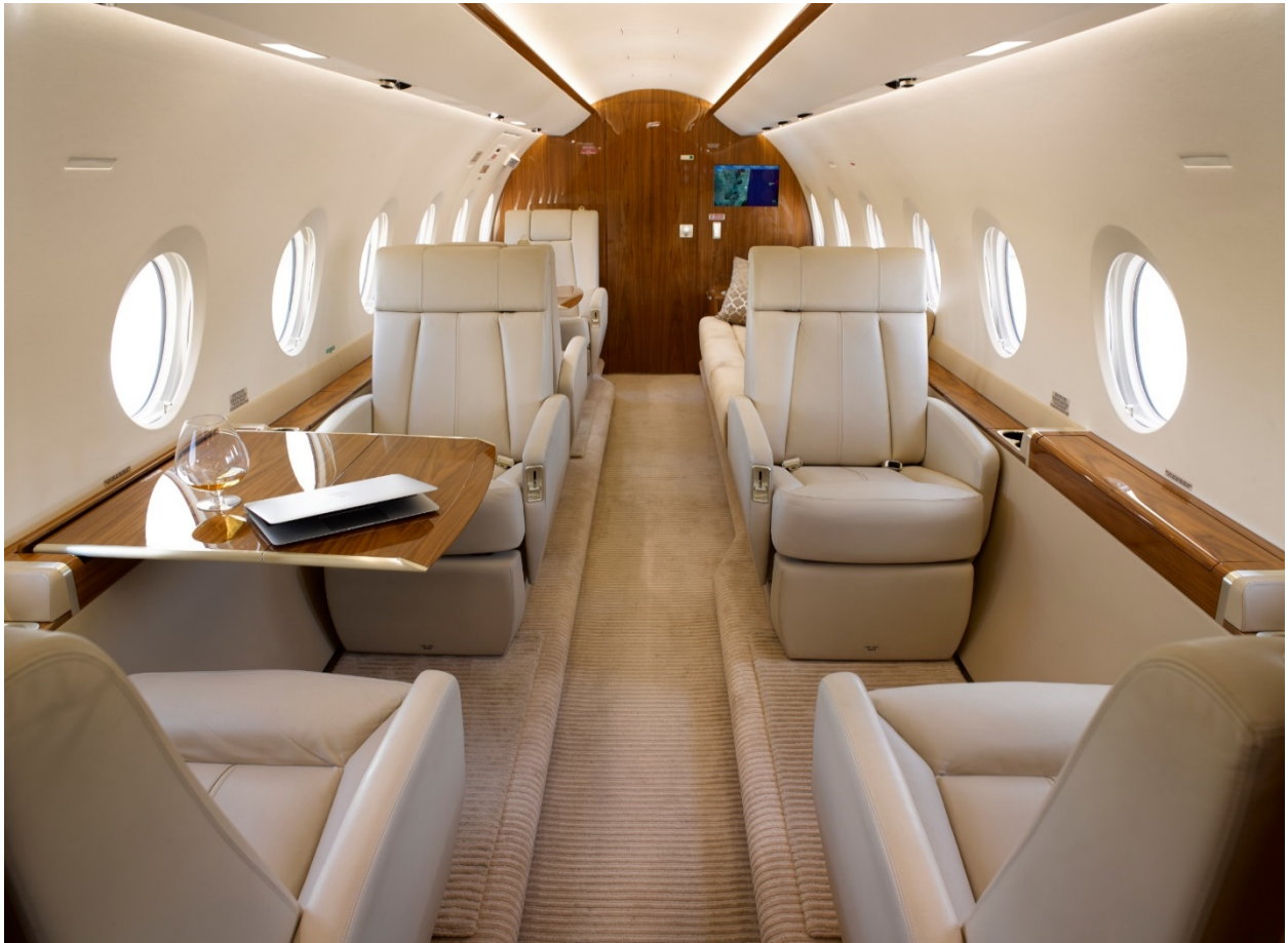
CABIN FWD CLUB SEATING

2016 Gulfstream G280 Serial G280-2101 VP-BRJ